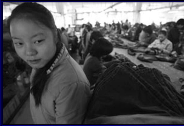
China Blue: Teddy Bear Films 2005

China blue is a documentary that shows how companies exploit children.